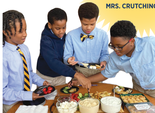
Scholars sampling Egyptian mezze.

Every day, scholars may be seen lounging in blue bean bag chairs, quietly engrossed in books or sharing discoveries with friends.