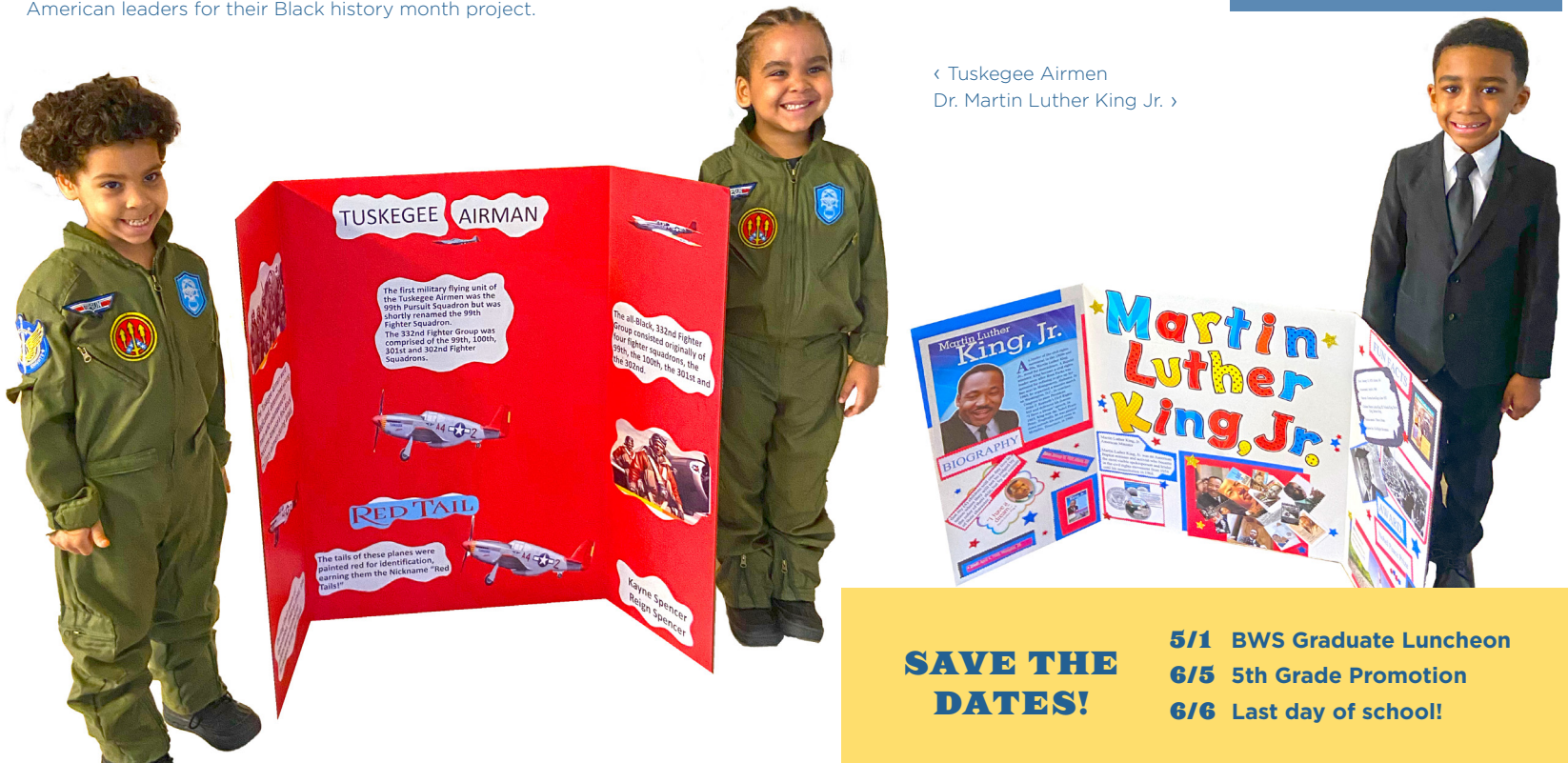
◀ Tuskegee Airmen Dr. Martin Luther King Jr. ▶